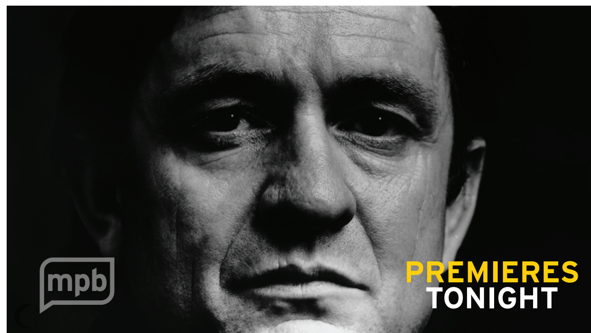
Example of using an accent color